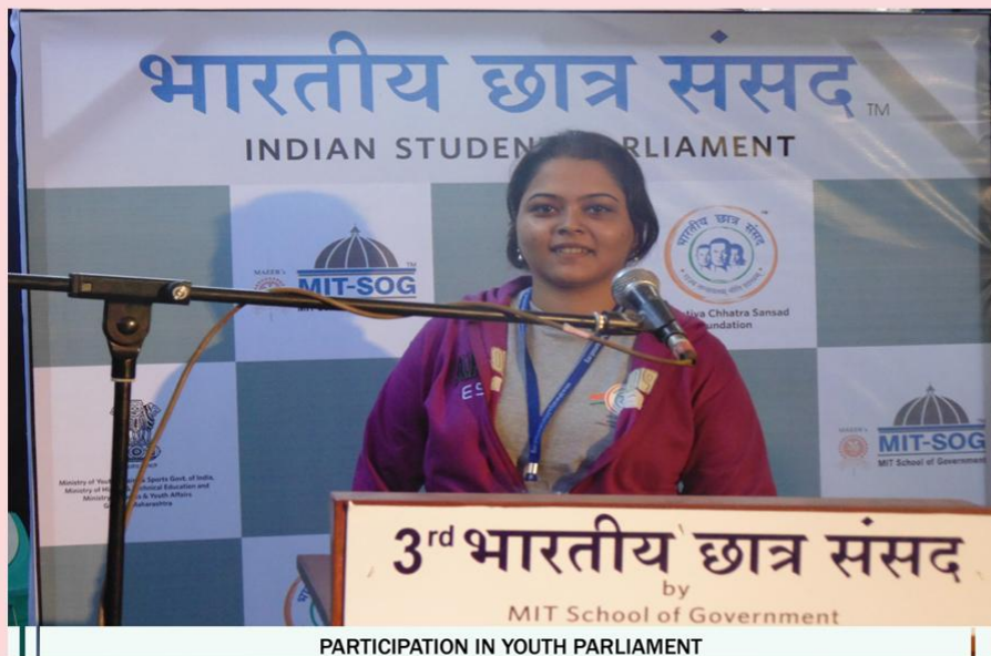
PARTICIPATION IN YOUTH PARLIAMENT