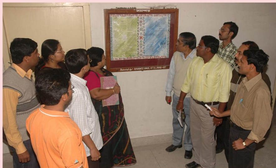
PUBLISHED COLLEGE WALL MAGAZINE